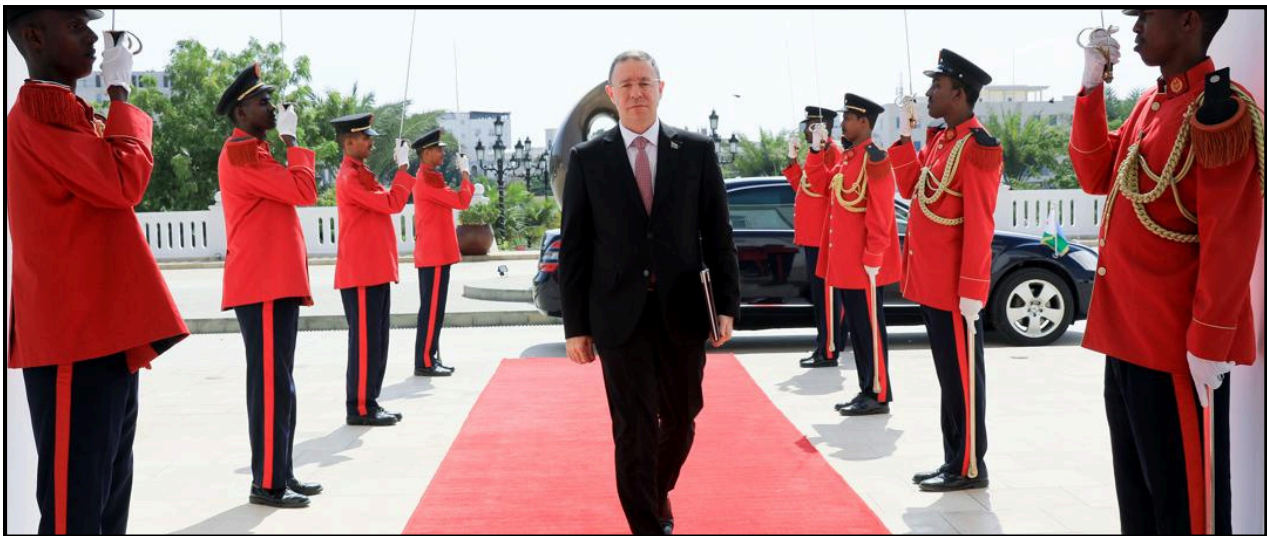
Photo: The Ambassador of the Republic of Azerbaijan entering the Presidential Palace.

During the presentation of Letters of Credence to the President of the Republic, Head of Government, an advisor from the State Protocol visits the designated ambassador's place of residence (hotel or residence). The advisor invites the ambassador to sit in the rear right-hand seat of the State Protocol vehicle, while the advisor takes the left-hand seat. Before departure, the advisor ensures that the ambassador has the Letters of Credence in their possession.