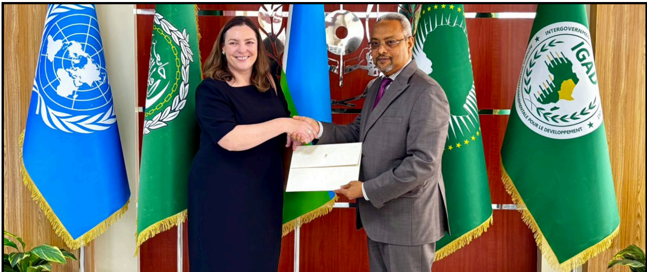
Photo: The Ambassador of Ireland presenting her copies of credentials to the Minister of Foreign Affairs and International Cooperation

The Protocol vehicle collects the ambassador from the hotel, in accordance with the established schedule, to take them to the Ministry of Foreign Affairs and International Cooperation (MAECI). There, they are received by the Minister for the submission of copies of credentials. This protocol step, which does not involve an escort or honor guard and during which the flag is not displayed on the vehicle, lasts approximately 15 minutes.